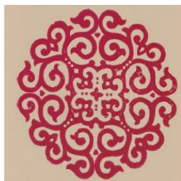
□ T-3 OM-Mandala