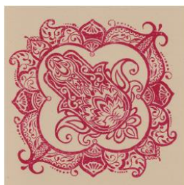
□ T-2 Hamsa