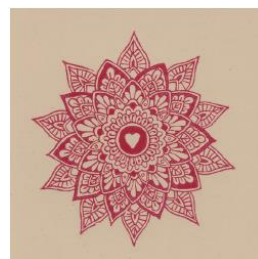
□ T-4 Flower heart