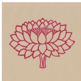
□ T-1 Lotus