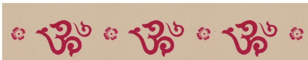
□ R-2 OM-Lotus