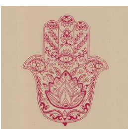
□ T-9 Hamsa big