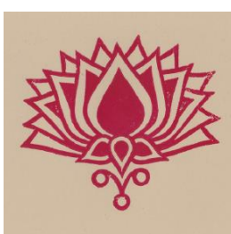
□ T-8 Lotus