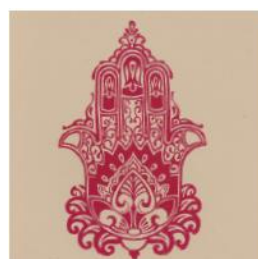
□ T-5 Hamsa