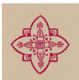
□ T-7 Muladhara