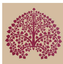
□ T-10 Bodhi Tree