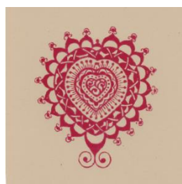
□ T-6 Anahata